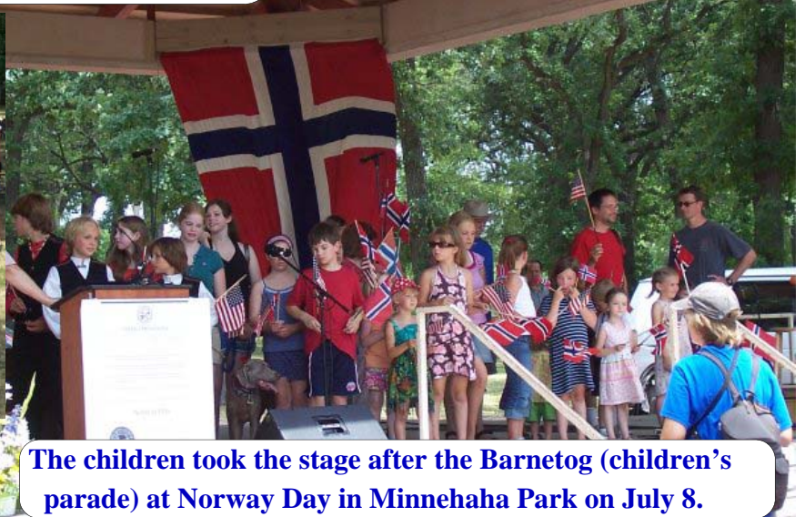
The children took the stage after the Barnetog (children's parade) at Norway Day in Minnehaha Park on July 8.

Pictured above are some of our summer activities for 2007. For more details, see inside.