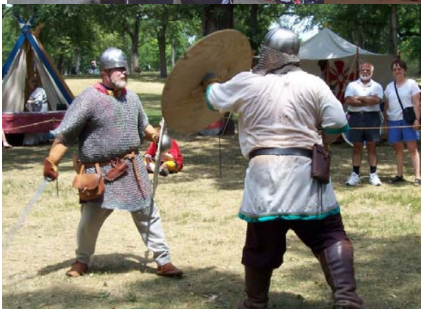
The battle rages at Norway Day in Minnehaha Park on July 8.