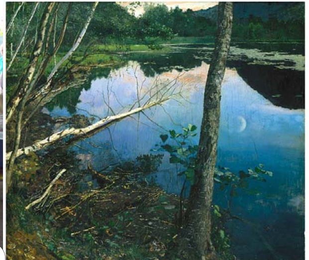
Eilif Peterssen, 1852-1928 Summer Night, 1886 (Scandinavian art show in July/August)