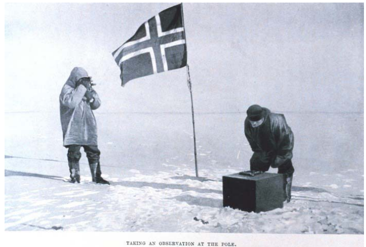
TAKING AN OBSERVATION AT THE POLE.