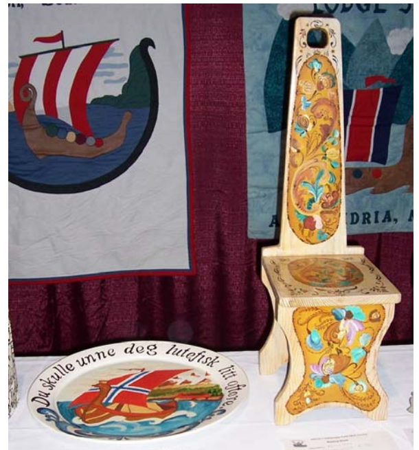
Axel Torvi's rosemal plate and pouting chair, for silent auction at convention.