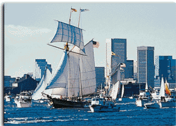
The Pride of Baltimore II