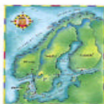
Heritage and Culture Displays